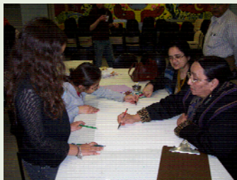
Seniors and Youth Program students work together during an inter-generational event at the IAC in April 2007.