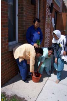
Indo-American Center staff and clients working together, planting flowers outside IAC.

The mission of the Indo-American Center is to promote the well being of South Asian Americans and immigrants through services that facilitate their adjustment, integration and friendship with the wider society, nurture their sense of community, and foster appreciation for their heritage and culture.