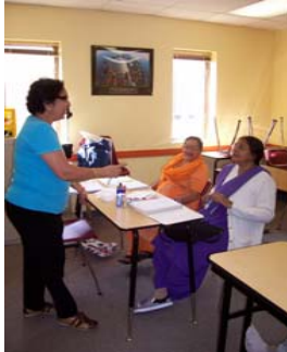
An ESL volunteer assists her students with English vocabulary and grammar during class.

The Indo-American Center is always looking for additional support and assistance from anyone that can spare time or offer donations. Volunteers are welcome to share their skills with the Center's clientele in various classes and programs. The experience is richly rewarding and often leads to long term friendships.